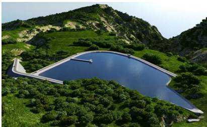
Upper reservoir, Barragem do Pico da Urze—1 000 000 m 3

In order to give sustainability to the electric system and to maximize the use of renewable resources (hydro and wind) in the island of Madeira (Portugal), Empresa de Electricidade da Madeira, S.A. (EEM) is developing a project for the expansion of the hydroelectric capacity in Calheta. The contract for the expansion of the hydroelectric power station and the pumping station was awarded to the Consortium Energetus SA (Hydro Equipment) and Afavias SA (Civil Works). The project is currently under construction and will increase the production of electric power by 30 MW from 2017. The pumping station will have a total power consumption of 15 MW and will operate with variable frequency drive (VFD).