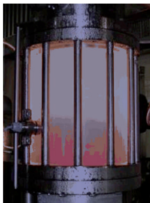
Ice separation column