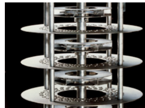
Kuhni™ column internals