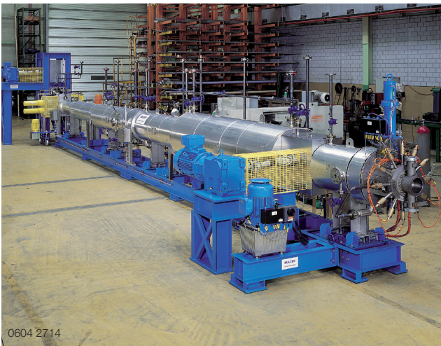
Sulzer EPS Unit ready for shipment

The Sulzer EPS Process is, contrary to the conventional suspension polymerization process, a fully continuous production process for expandable polystyrene. The foaming agent, which can be the same as in the suspension process (i.e. pentane), is injected in liquid form and at high pressure into polystyrene melt.