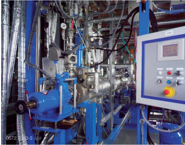
EPS Pilot Unit at Sulzer facilities in Winterthur

The cooled, highly viscous mixture is then pelletized in an under-water pelletizing system. The dried and separated EPS micropellets are finally conveyed to silos or containers. The whole process is carried out under conditions which avoid any premature foaming.